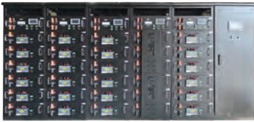
Powerhome- L Series 600-1000vdc