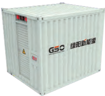
Power Room- 10H